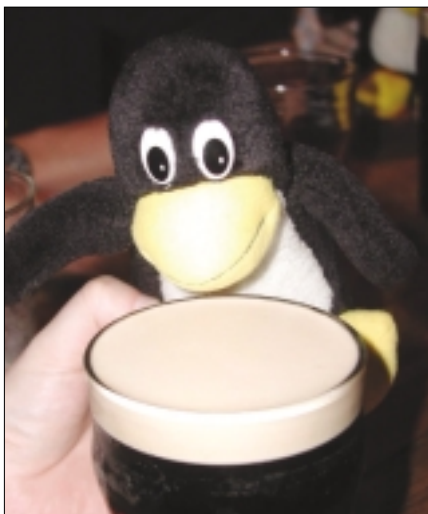
Figure 3: Guinness is good for you