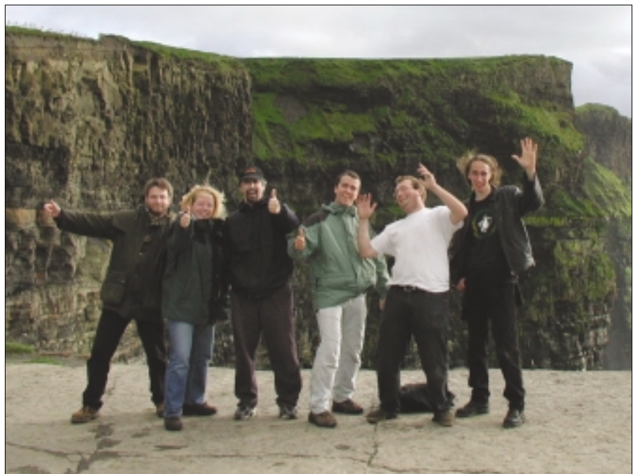
Figure 4: Hacking the Cliffs