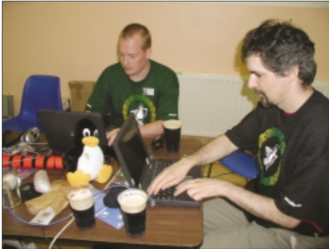
Figure 1: Happy Hacking