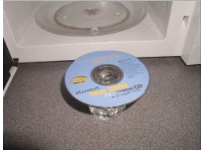
Figure 2: Sacrificed on the Linux Beer Walk Altar