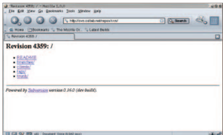
Figure 1: Screenshot of Mozilla pointing at the Subversion repository

In addition, requesting a file off a branch in CVS requires time proportional to the number of revisions since the branch point with the HEAD branch, plus the number of revisions made in HEAD since the branch point. RCS files store the latest revision in HEAD as full text, and any time you request the text of another version, it has to be constructed. This means, for a file on a branch,