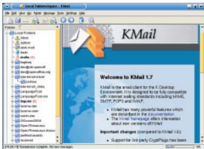
Figure 3: Kontakt's Kmail client.

Kontakt demonstrates that groupware is not a monoculture. Even though it does not support the full groupware server functionality, the combinations we looked at in this article are quite capable of handling the scenarios previously dominated by Exchange and Outlook. ■