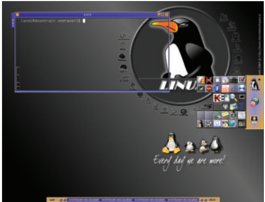
Figure 3: Three “wmdrawer” instances on a single desktop.

Pseudo-transparency: Instead of being genuinely transparent, applications that support pseudo-transparency simply use an appropriate part of the desktop as the background. Windows behind the pseudo-transparent program are hidden.